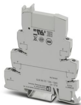
VARIOFACE feed-through terminal block (2-conductor screw connection), for PLC-INTERFACE universal series

Please be informed that the data shown in this PDF document is generated from our online catalog. Please find the complete data in the user documentation. Our general terms of use for downloads are valid.