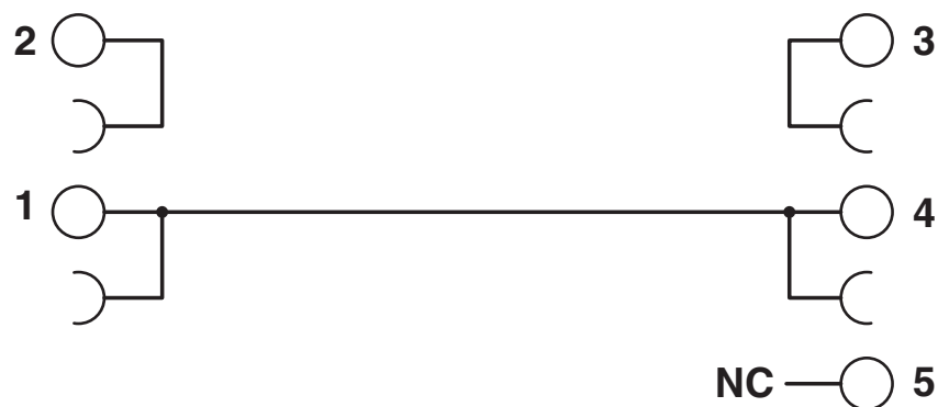
PLC-VT connection scheme