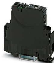
Electronic circuit breaker

Please be informed that the data shown in this PDF document is generated from our online catalog. Please find the complete data in the user documentation. Our general terms of use for downloads are valid.