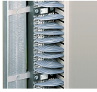
Installation example: Matrix patchboards in a frame