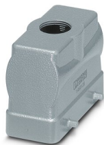
HEAVYCON B16 sleeve housing, for double locking latch, height: 76 mm, with 1 x M32 thread, straight cable outlet

Please be informed that the data shown in this PDF document is generated from our Online Catalog. Please find the complete data in the user documentation. Our General Terms of Use for Downloads are valid.