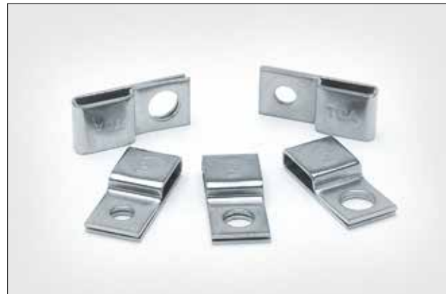
Stainless Steel P-Mount SSPC for use in arduous environments.