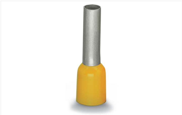
Color: ■ yellow