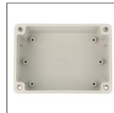
Internal mounting points for PC boards or panels