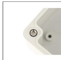
Features corrosion resistant inserts for lid assembly