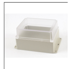
Some models supplied with deep lids.