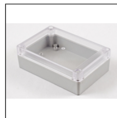
Clear Lid (polycarbonate version shown)