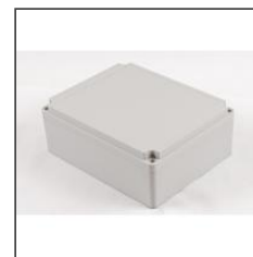
Some models supplied with styled lid.