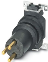
Contact carrier, 3-position, Pin, straight, M8, coding: A, PCB mounting, SMD reflow, this item is undergoing a smooth changeover, lead-free alternative in accordance with RoHS II without exception 6c (Pb < 0.1%) possible on request in advance

Please be informed that the data shown in this PDF document is generated from our online catalog. Please find the complete data in the user documentation. Our general terms of use for downloads are valid.