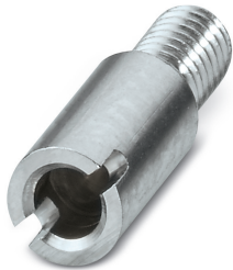
Female test connector, color: silver

Please be informed that the data shown in this PDF Document is generated from our Online Catalog. Please find the complete data in the user's documentation. Our General Terms of Use for Downloads are valid ( http://phoenixcontact.com/download )