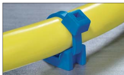
Fixing Tie Mount KR6G5-E/TFE.

Designed specifically for holding heavier cable bundles these mounting bases can be used in many industries from agriculture to truck manufacture, they offer a very secure fixing and can be used with a wide variety of heavy duty cable ties up to 7.6mm wide.