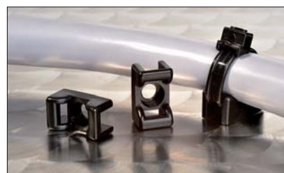
Cable Tie Mounts KR6G5, KR8G5 and CTM.