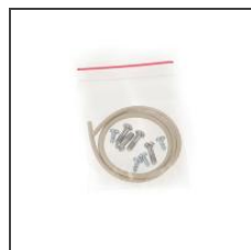
Hardware includes lid screws, PC board screws, and gasket