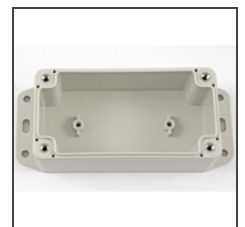
Internal DIN rail mounting point.