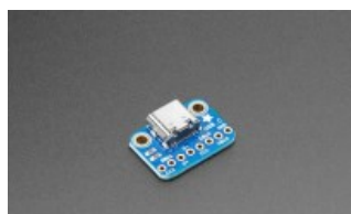
Adafruit USB Type C