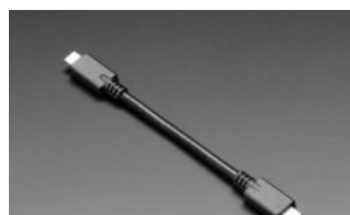
USB C to USB C Cable -