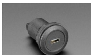
USB C Jack to USB A Jack