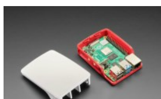
Official Raspberry Pi