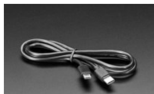
USB C to Micro B Cable - 3