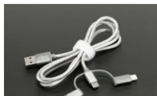
USB 3-in-1 Sync and Charge