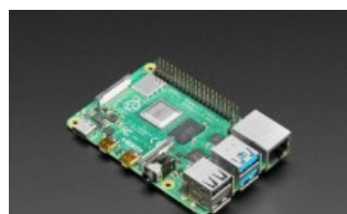
Raspberry Pi 4 Model B - 2