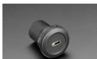
USB C Jack to USB C Jack