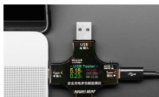
Multifunctional USB Digital