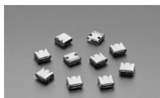
USB Type C SMT / THM