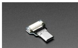
DIY USB Cable Parts -