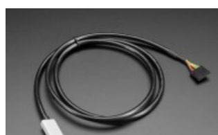
FTDI Serial TTL-232 USB