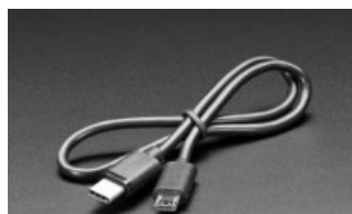
USB C to Micro B Cable - 1