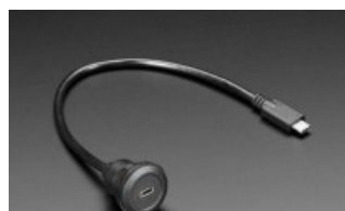
USB C Round Panel Mount