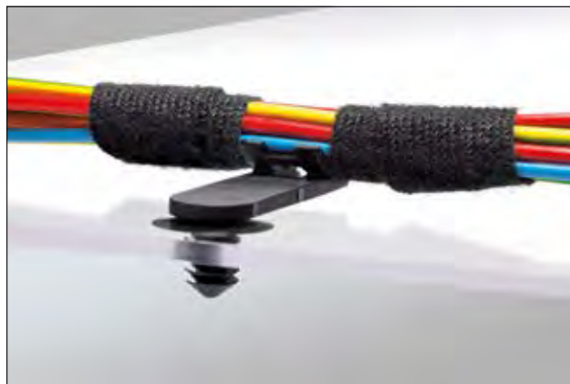
COW Clip used as tape-on clip.