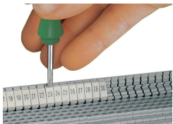
Snapping a WMB marker strip into the marker slot of the double marker carrier.