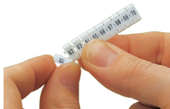
Separating an individual marker from the WMB marker strip – for larger terminal blocks.