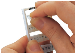
Separating a strip from the WMB or WMB marker card.