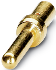
Crimp contact, turned, Single contact, contact diameter: 1 mm, crimp range: 0.14 mm 2 ... 0.56 mm 2

Please be informed that the data shown in this PDF Document is generated from our Online Catalog. Please find the complete data in the user's documentation. Our General Terms of Use for Downloads are valid ( http://phoenixcontact.com/download )