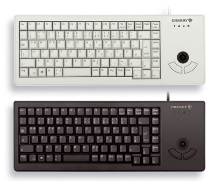
Models may vary from the image shown