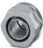
Cable gland made from PP with metric thread, IP65 protection

Screw connection - WP-G PP HF M32 - 3241000