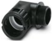
Cable gland, metric thread, IP68/69k protection, angled

Screw connection - WP-GA HF IP69K M32 BK - 3240914