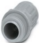
Cable gland made from PP with metric thread, rotatable, IP54 protection

Screw connection - WP-GT PP HF M32 - 3241014