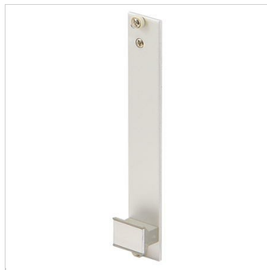
Illustration shows plug-in unit, 3 U, 4 HP