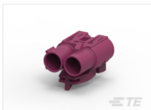
TE Part #5-1924855-4 JACK HOUSING, 2 POSN, FAKRA, Key D,CpSlT