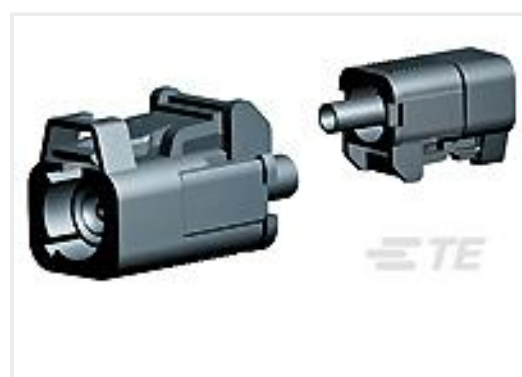
TE Part #1924792-6 PLUG KIT, UNASSEM, 1 POS, RG-316 OR RG-1