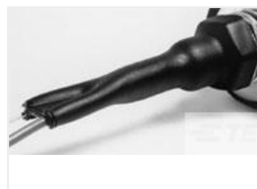
TE Part #550105P066 SCL-3/4-A1-0-50MM