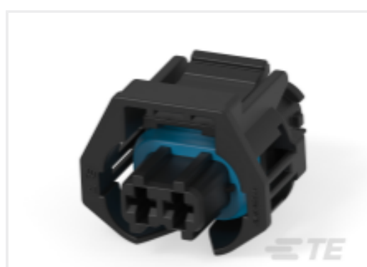
TE Part #2005388-6 JPT SLD 2P PLUG ASSY-1S BLK