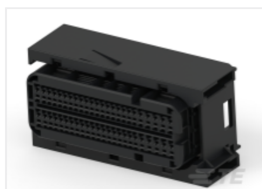
TE Part #8-1564284-1 96POS,MCON-1.2 CB,REC HSG,ASSY