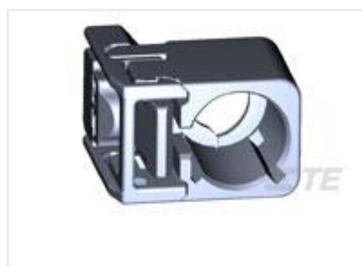
TE Part #2141494-6 1POS,CONTACT KIT,REC HSG,ASSY, CODF