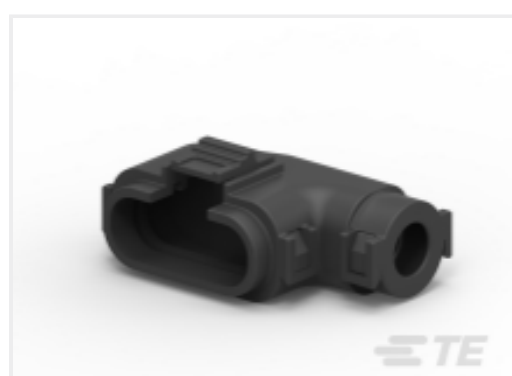
TE Part #1-2109570-2 MCON 5P PLUG COVER TYPE-B BLK