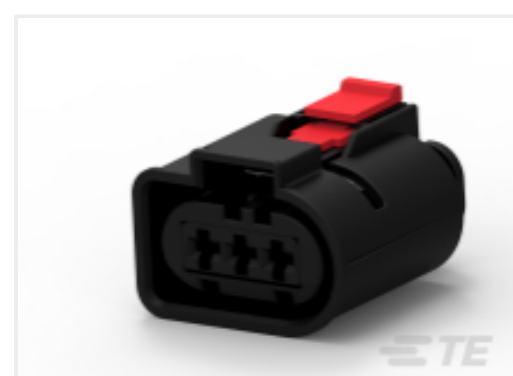
TE Part #1-1718625-1 3 POS HSG AMP MCP 2.8 ASSY