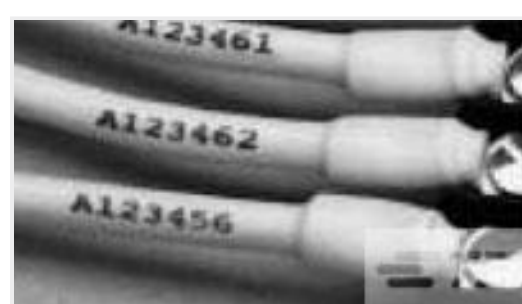
TE Part #505325P092 RNF-100-3/4-A1-RD-55MM