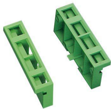
Side element, with marker groove, labeling with SS-ZB. Width: 11 mm, length: 45 mm, height: 21 mm

Please be informed that the data shown in this PDF document is generated from our online catalog. Please find the complete data in the user documentation. Our general terms of use for downloads are valid.