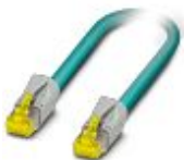
Patch cable, CAT6 A , 4-pair, shielded, connection not crossed (line), assembled at both ends with RJ45/IP20 connectors, outer sheath material: PUR, length: 2.0 m

Patch cable - NBC-R4AC/10G-R4AC/10G-94F/2,0 - 1408360