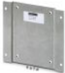
Mounting plate for SFNT switches

Mounting plate - FL PA SFNT 5-8 - 2891012