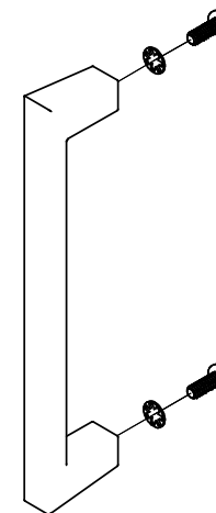
TYPICAL HANDLE ASSEMBLY