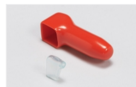
Insulation Boots & Sleeves(5)