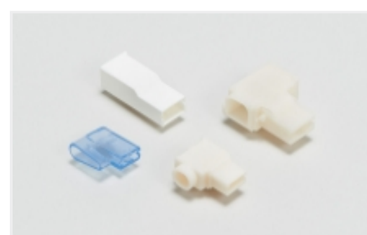
Crimp Terminal Housings(163)