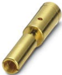
Crimp contact, turned, Contact diameter: 1 mm, Crimp range: 1 mm 2 ...1.5 mm 2

Please be informed that the data shown in this PDF Document is generated from our Online Catalog. Please find the complete data in the user's documentation. Our General Terms of Use for Downloads are valid ( http://phoenixcontact.com/download )