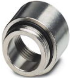
NPT adapter, IP68, up to 5 bar, incl. O-ring seal, M20 to 1/2"

Please be informed that the data shown in this PDF Document is generated from our Online Catalog. Please find the complete data in the user's documentation. Our General Terms of Use for Downloads are valid ( http://phoenixcontact.com/download )