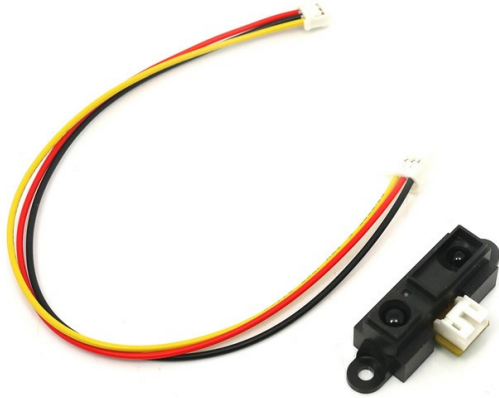
Grove - 80cm Infrared Proximity Sensor