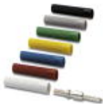
Insulating sleeve, Color: red