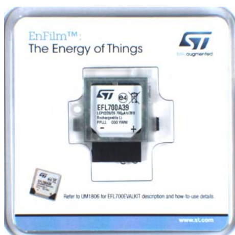
PMB top view