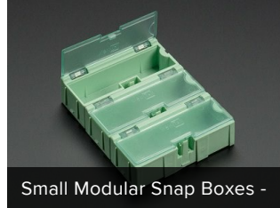
Small Modular Snap Boxes -