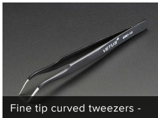
Fine tip curved tweezers -