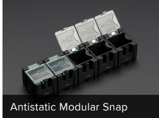
Antistatic Modular Snap