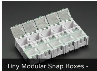
Tiny Modular Snap Boxes -