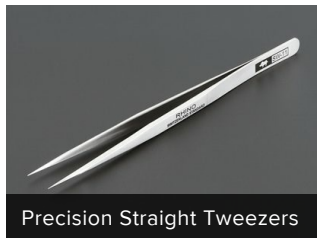
Precision Straight Tweezers