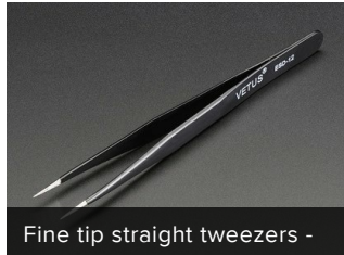
Fine tip straight tweezers -