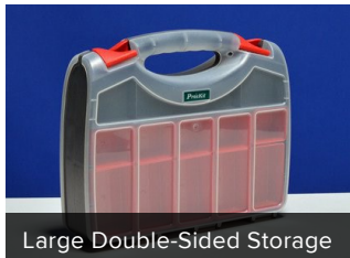
Large Double-Sided Storage