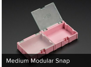
Medium Modular Snap