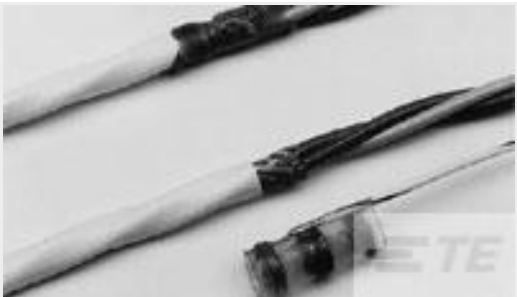
TE Part #898251-000 SO63-4-01