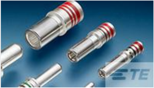
TE Part # 0662-207-0882 CONT SOC ASSY