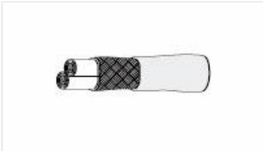
TE Part #325411-000 55A1121-20-9/96-9CS2275