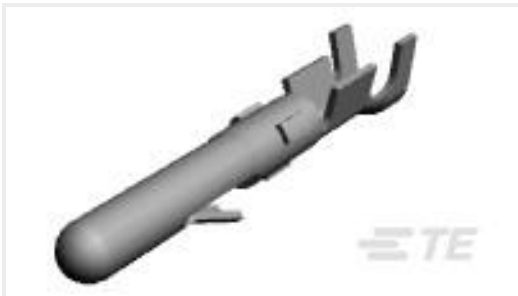
TE Part #61116-4 CMNL PIN 24-18 PTPHBZ