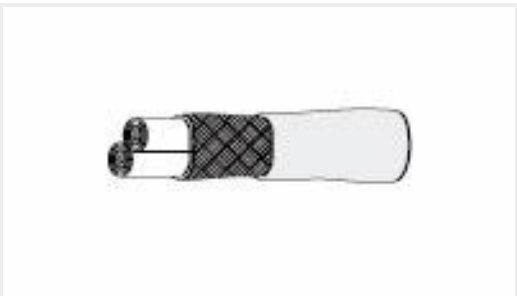
TE Part #074911-000 55A1821-20-9/96-9CS2275