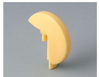
A1103004 Disk PA 6 (UL 94 HB) beach