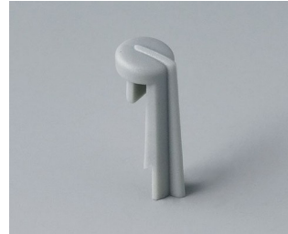
A1105007 Arrow PA 6 (UL 94 HB) mineral