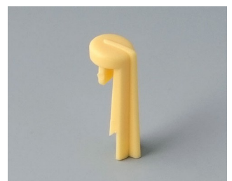
A1105004 Arrow PA 6 (UL 94 HB) beach