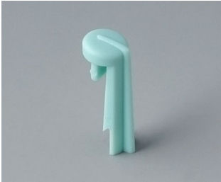
A1105005 Arrow PA 6 (UL 94 HB) lagoon