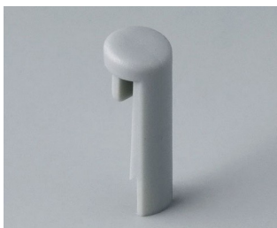
A1101007 Pin PA 6 (UL 94 HB) mineral