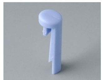
A1101006 Pin PA 6 (UL 94 HB) sky