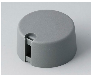
A1031648 TOP-KNOBS 31 PA 6 volcano 31x16mm