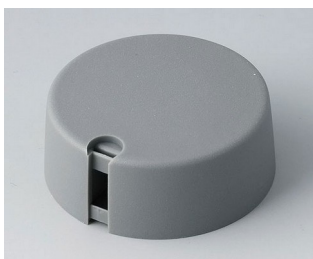
A1040068 TOP-KNOBS 40 PA 6 volcano 40x16mm 6mm