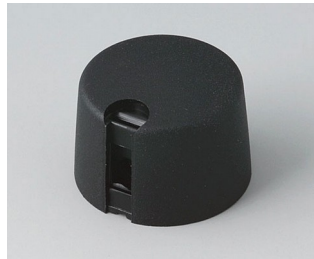
A1024649 TOP-KNOBS 24 PA 6 nero 24x16mm