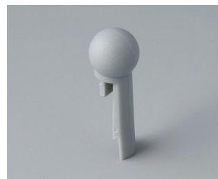
A1102007 Globe PA 6 (UL 94 HB) mineral