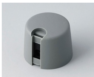
A1020648 TOP-KNOBS 20 PA 6 volcano 20x16mm