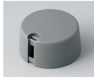
A1031048 TOP-KNOBS 31 PA 6 volcano 31x16mm 4mm