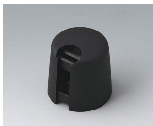
A1016649 TOP-KNOBS 16 PA 6 nero 16x16mm