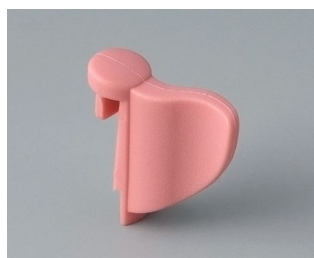
A1104003 Wing PA 6 (UL 94 HB) coral