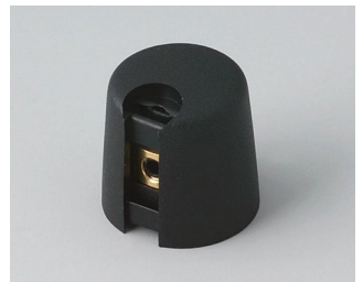
A1016069 TOP-KNOBS 16 PA 6 nero 16x16mm 6mm