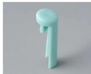
A1101005 Pin PA 6 (UL 94 HB) lagoon