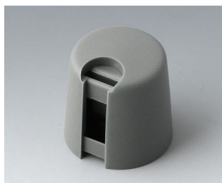
A1016648 TOP-KNOBS 16 PA 6 volcano 16x16mm