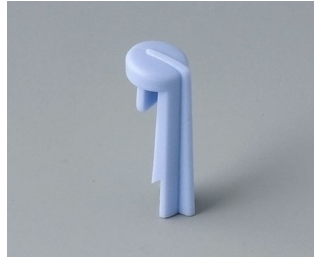
A1105006 Arrow PA 6 (UL 94 HB) sky