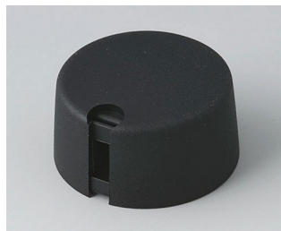
A1031649 TOP-KNOBS 31 PA 6 nero 31x16mm