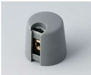
A1016048 TOP-KNOBS 16 PA 6 volcano 16x16mm 4mm