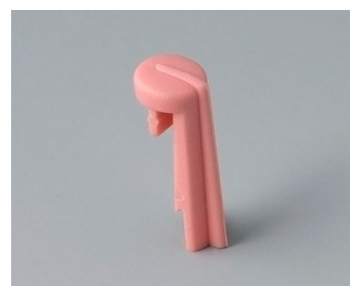
A1105003 Arrow PA 6 (UL 94 HB) coral