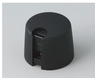
A1020649 TOP-KNOBS 20 PA 6 nero 20x16mm