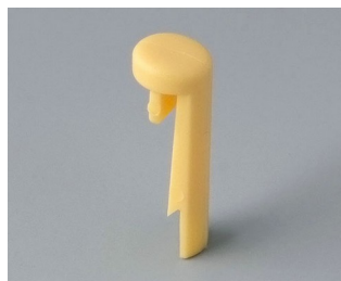
A1101004 Pin PA 6 (UL 94 HB) beach