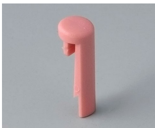
A1101003 Pin PA 6 (UL 94 HB) coral