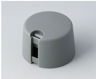
A1024648 TOP-KNOBS 24 PA 6 volcano 24x16mm