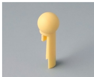
A1102004 Globe PA 6 (UL 94 HB) beach