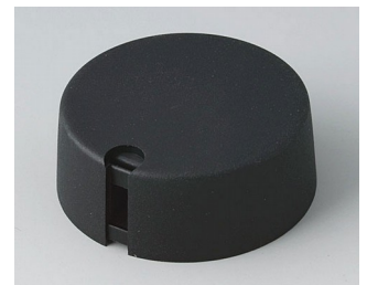
A1040049 TOP-KNOBS 40 PA 6 nero 40x16mm 4mm