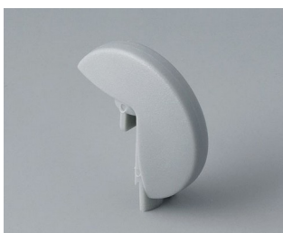
A1103007 Disk PA 6 (UL 94 HB) mineral