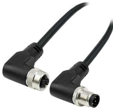
MALE FACE VIEW

(M12 Cordset, 5 Position, 16 AWG Unshielded, Male 90° to Female 90°)