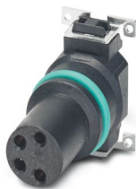
Contact carrier, 4-position, Socket, straight, M8, coding: A, PCB mounting, SMD reflow

Please be informed that the data shown in this PDF document is generated from our online catalog. Please find the complete data in the user documentation. Our general terms of use for downloads are valid.