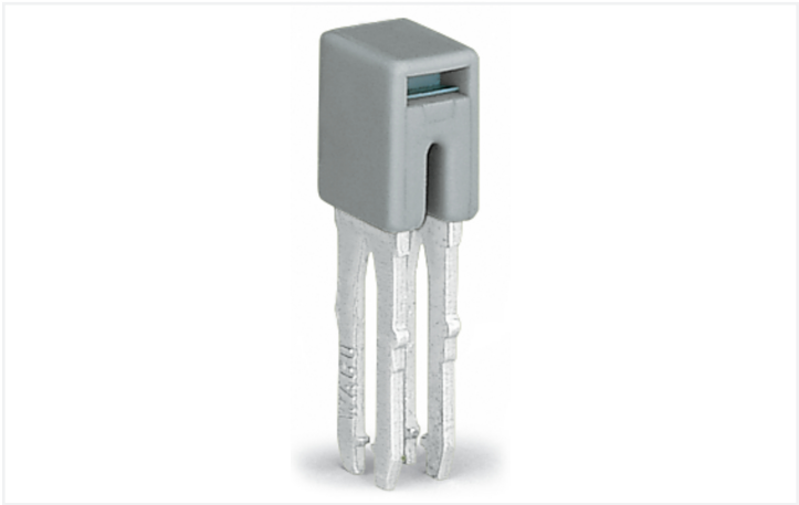
Color: ■ gray Similar to illustration