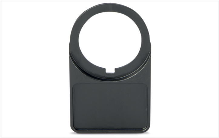
Color: ■ black