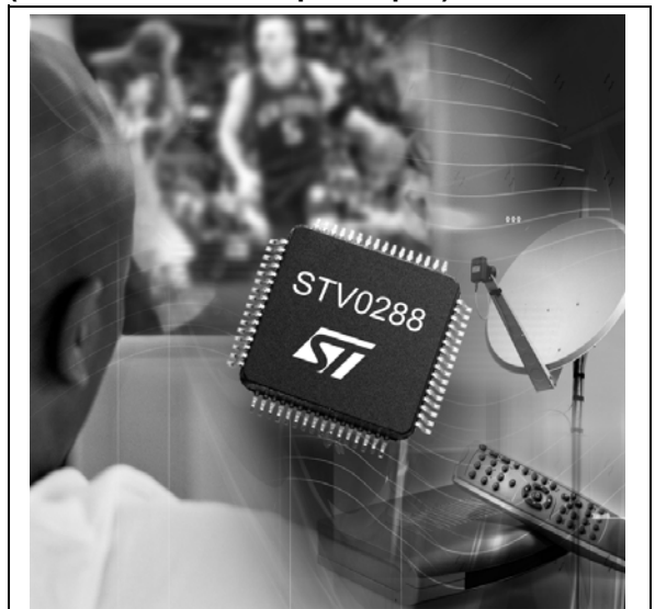
Figure 1. Package (TQFP64 with non exposed pas)

The device operates up to 120 MHz and can process variable modulation rates, up to 60 Msp. The chip outputs MPEG transport streams and interfaces seamlessly to the packet demultiplexers embedded in the ST Omega chip family. Its low power consumption, small package and low bill of material makes it perfect for all satellite applications.