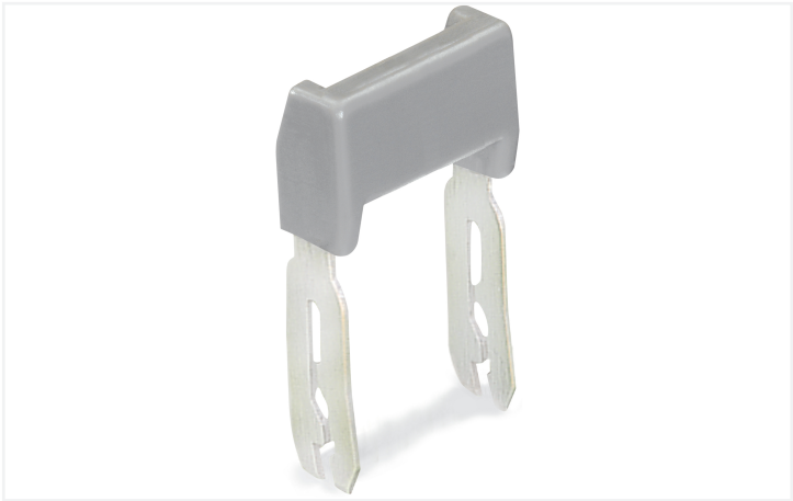
Color: ■ gray