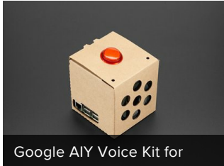
Google AIY Voice Kit for