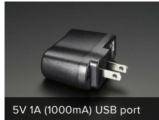
5V 1A (1000mA) USB port