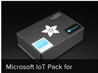
Microsoft IoT Pack for