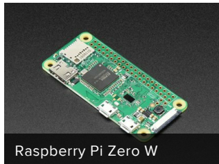
Raspberry Pi Zero W