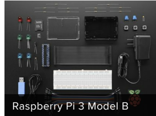
Raspberry Pi 3 Model B