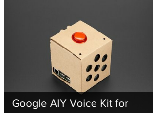
Google AIY Voice Kit for