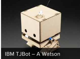
IBM TJBOT – A Watson