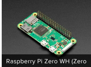
Raspberry Pi Zero WH (Zero)