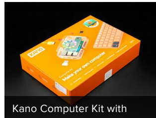
Kano Computer Kit with