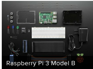
Raspberry Pi 3 Model B