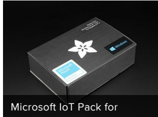
Microsoft IoT Pack for