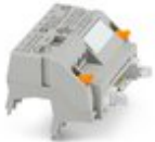
V8 adapter for 8 x PLC-INTERFACE (6.2 mm), controller: PLC system cabling of output cards, connection 1: Screw connection 1x, connection 2: IDC/FLK pin strip 1x 14-position, connection 3: Plug-in connection (Can be snapped onto 8x PLC-INTERFACE terminals), number of channels: 8, control logic: plusschaltend

System connection - PLC-V8/FLK14/OUT - 2295554