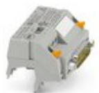
V8 adapter for 8 x PLC-INTERFACE (6.2 mm), controller: PLC system cabling of output cards, connection 1: Screw connection 1x, connection 2: D-SUB pin strip 1x 15-position, connection 3: Plug-in connection (Can be snapped onto 8x PLC-INTERFACE terminals), number of channels: 8, control logic: plusschaltend

Adapter module - PLC-V8/D15S/OUT - 2296058