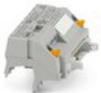
V8 adapter for 8 x PLC-INTERFACE (6.2 mm), controller: PLC system cabling of output cards, connection 1: Screw connection 1x, connection 2: IDC/FLK pin strip 1x 14-position, connection 3: Plug-in connection (Can be snapped onto 8x PLC-INTERFACE terminals), number of channels: 8, control logic: minusschaltend

System connection - PLC-V8/FLK14/OUT/M - 2304102