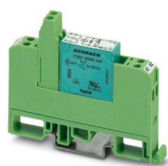
Relay module, with soldered-in miniature switching relay, gold contact for small loads, 1 changeover contact, input voltage 24 V DC

Please be informed that the data shown in this PDF document is generated from our online catalog. Please find the complete data in the user documentation. Our general terms of use for downloads are valid.