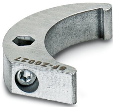
Hook wrench, series: RC

https://www.phoenixcontact.com/us/products/1607455