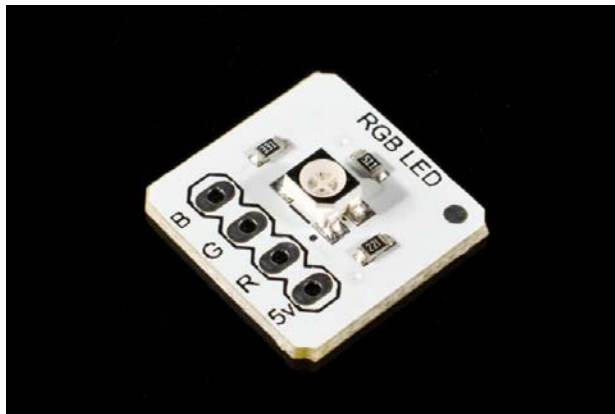
RGB LED Breakout (3528)