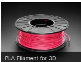
PLA Filament for 3D