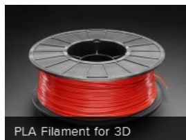
PLA Filament for 3D