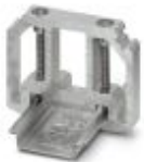
End clamp, for end support of UKH 50 to UKH 240, is pushed onto DIN rail NS 35 and fixed with 2 screws, width: 10 mm, color: aluminum