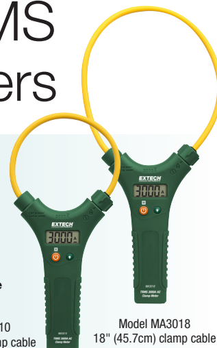
Model MA3018 18" (45.7cm) clamp cable