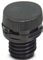
Pressure compensation element, material for screw connection: PA, connecting thread: M12 x 1.5, color: jet black, with O-ring

Please be informed that the data shown in this PDF document is generated from our online catalog. Please find the complete data in the user documentation. Our general terms of use for downloads are valid.