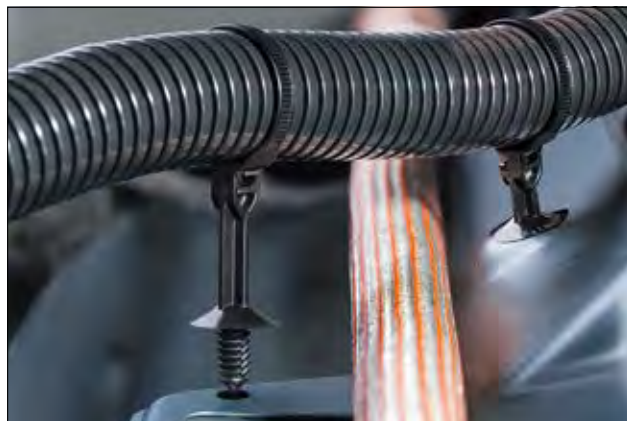
T50ROSFT6S25SO and T50ROSFT612.5SO.