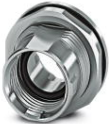
Housing screw connection, Socket, Link: M12-SPEEDCON, Rear mounting, M15 x 1

Please be informed that the data shown in this PDF Document is generated from our Online Catalog. Please find the complete data in the user's documentation. Our General Terms of Use for Downloads are valid ( http://phoenixcontact.com/download )