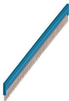
Plug-in bridge, pitch: 3.5 mm, number of positions: 50, color: blue

Please be informed that the data shown in this PDF document is generated from our online catalog. Please find the complete data in the user documentation. Our general terms of use for downloads are valid.