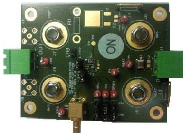
Figure 1. Evaluation Board Picture

This document has to be used together with the NCP6361 datasheet. The datasheet contains full technical details regarding the NCP6361 specifications and operation. The board (FR4 material) is implemented in 4 metal layers. The top and bottom layers have thicknesses of 35 \mu\text{m} (1 oz). The PCB thickness is 1.6 mm with dimensions of 77 mm by 55 mm (see Figure 1).